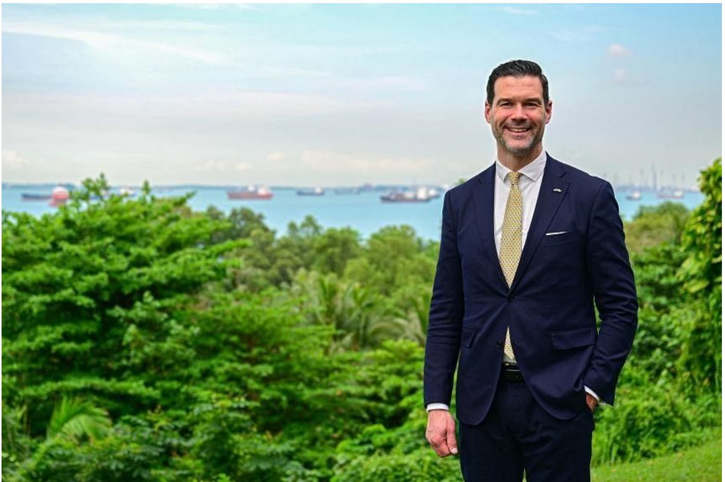
Swedish Minister for International Development Cooperation and Foreign Trade Johan Forssell in Singapore for the Sweden Indo-Pacific Business Summit on Dec 5.

SINGAPORE: Sweden announced a new trade and investment strategy for South-east Asia as part of its plans to deepen cooperation with like-minded partners, including Singapore.